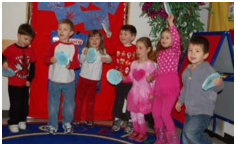
The children "shaking their flake" during the Valentine's Day Song/Poem Presentation. See more pictures from the parties on page 6.