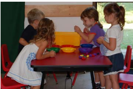
Our First Years class cooperating to sort bears by color