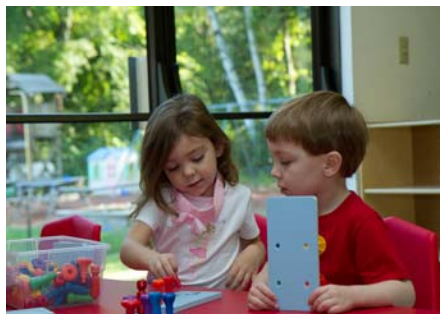
Jumping right in to table top activities on the first day